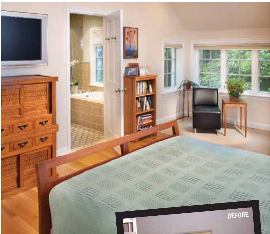
On the second floor, the spiral staircase (inset) was removed in the master bedroom (above); light pours in through new windows. The luxurious master bathroom (top) is complete with a frameless shower, dual sinks and a tub with a view.